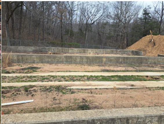
sludge drying beds (the one on the right has not been used for several months)