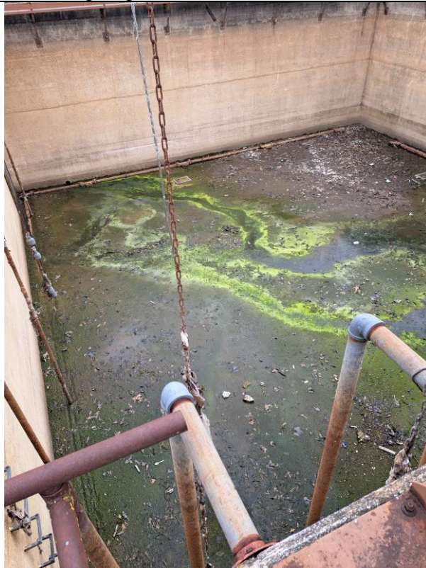
aerated equalization basin (not used for several months)