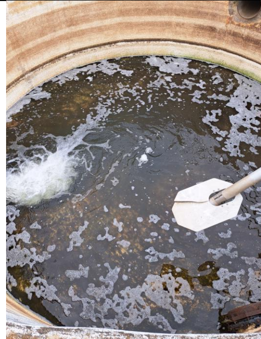
post aeration (not used for several months)